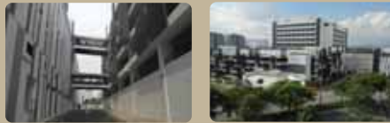
Desa ParkCity Hospital, Kuala Lumpur Target : 100% Actual : 99.63%