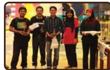
Male Team – 2nd Runner Up