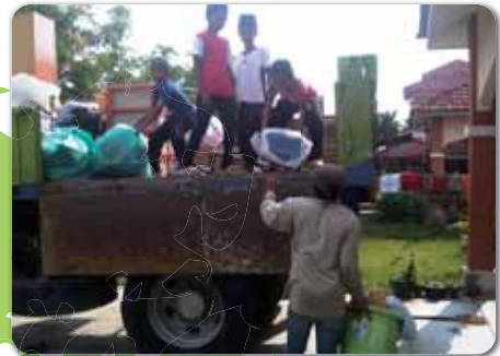
Some of the children from the home help to load some household items onto the lorry assisted by PPB's general worker during the house moving process.