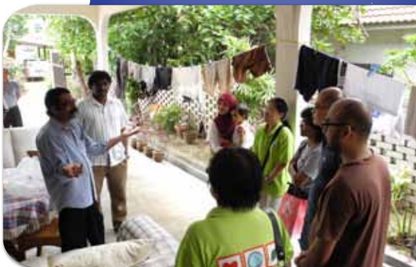
A briefing session by the home caretaker.