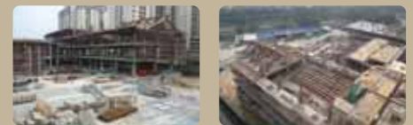
Jing Si Hall, Kuala Lumpur Target : 34.0% Actual : 30.0%