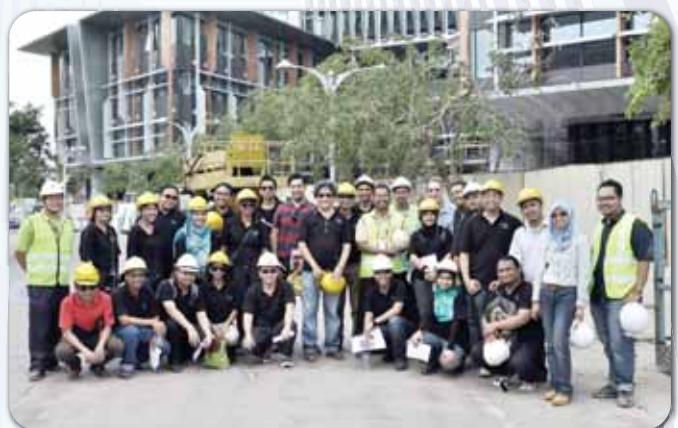
7 Apr 2012: Pakatan Reka Arkitek organized a Staff Workshop at Project 2C2 construction site.