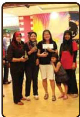
Female Team – Champion