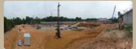
AraGreen Residences, Kuala Lumpur Target : 0.88% Actual : 1.56%