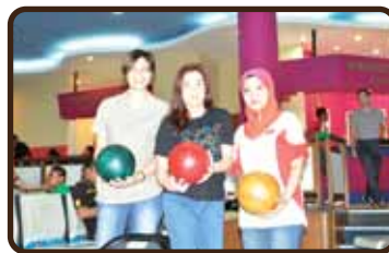
Female Team – 2nd Runner Up