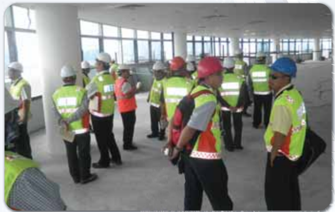
26 April 2012: OSH-ERT team from FELDA chose Menara Felda construction site as a field study venue for all its safety and emergency respond team members.