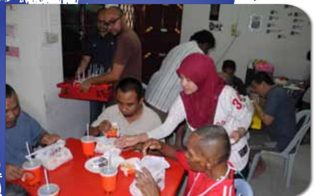
An A&W lunch treat for all.