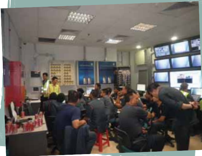
Members of Bomba Malaysia at the CCTV equipped fire control room which centralized and interfaced all emergency response systems.

On 29 March 2012, members from the Fire and Rescue Department of Malaysia ("Bomba Malaysia") held their in-house training at our 50-storey Menara Felda construction site.