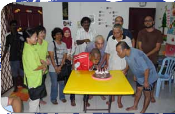
Celebrating Father's Day.

The home currently houses 15 male patients in a rented bungalow in Petaling Jaya. As an NGO, the home is strictly dependent on freewill donations from the public and companies. This home provides a place for rehabilitation for such patients before they return to their homes. Personal counseling and medical consultation is often carried out to ensure that the patients are healthy both emotionally and physically during the rehabilitation process.