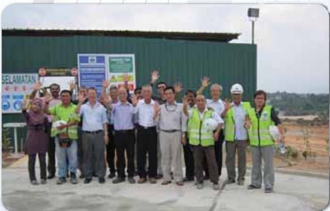
6 March 2012: Employees from sister company Putra Perdana Development Sdn Bhd visited Manipal International University construction site.