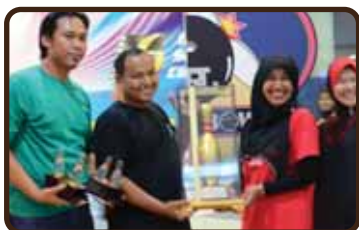
Male Champion and Winner of Challenge Trophy 2012