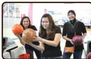
Female Team – 1st Runner Up