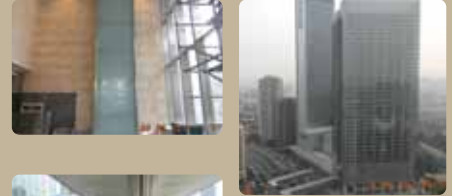
Integra Tower, Kuala Lumpur Target : 93.99% Actual : 98.44%