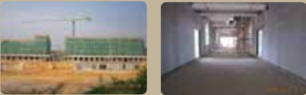
Manipal International University, Negeri Sembilan Target : 31.88% Actual : 21.13%