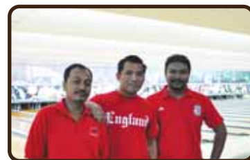
Male Team – 1st Runner Up