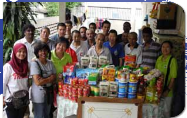
One for the album.