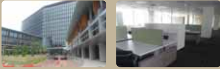
Menara PJH (2C2), Putrajaya Target : 100% Actual : 99.8%